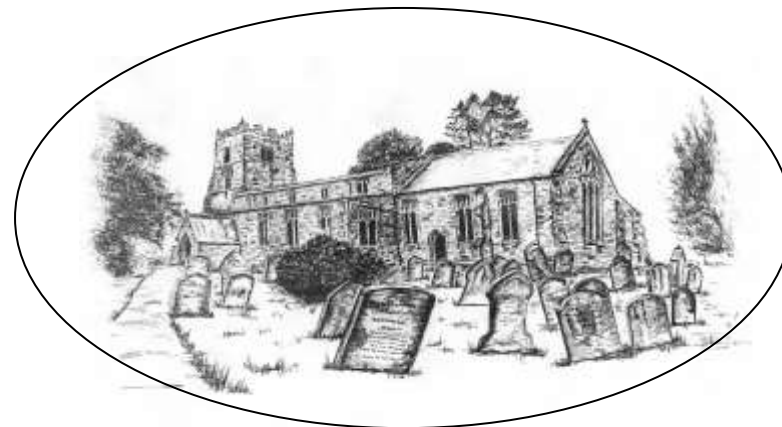
St John the Baptist & All Saints, Easingwold