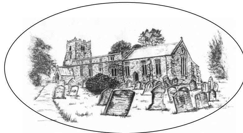
St John the Baptist & All Saints, Easingwold